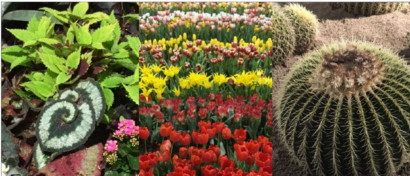
Philadelphia Flower Show - Photos submitted by David Furniss